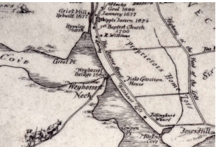
Providence in 1700

Weybosset was also where three important Aboriginal Indian trails met, one coming down from the north, the second up from the southeast Mount Hope region called the Wampanoag Trail, and the third up from Connecticut in the southwest called the Pequot Trail.