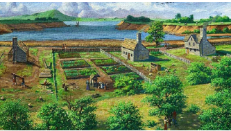
Depiction of Providence in 1650

The Antram-Gray House an early 18th century structure with a late 18th century addition, serves as the visitor center for Roger Williams National Memorial.