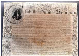
A portion of the original charter

The Neutaconkanut Hill Park is open year around from dawn to dusk near the intersection of Killingly and Sunset Avenue in the Silver Lake District of Providence (Take Interstate Route 195 to Rte 6 West to the RI-128/Killingly Street exit and follow Killingly Street south to Sunset Avenue).